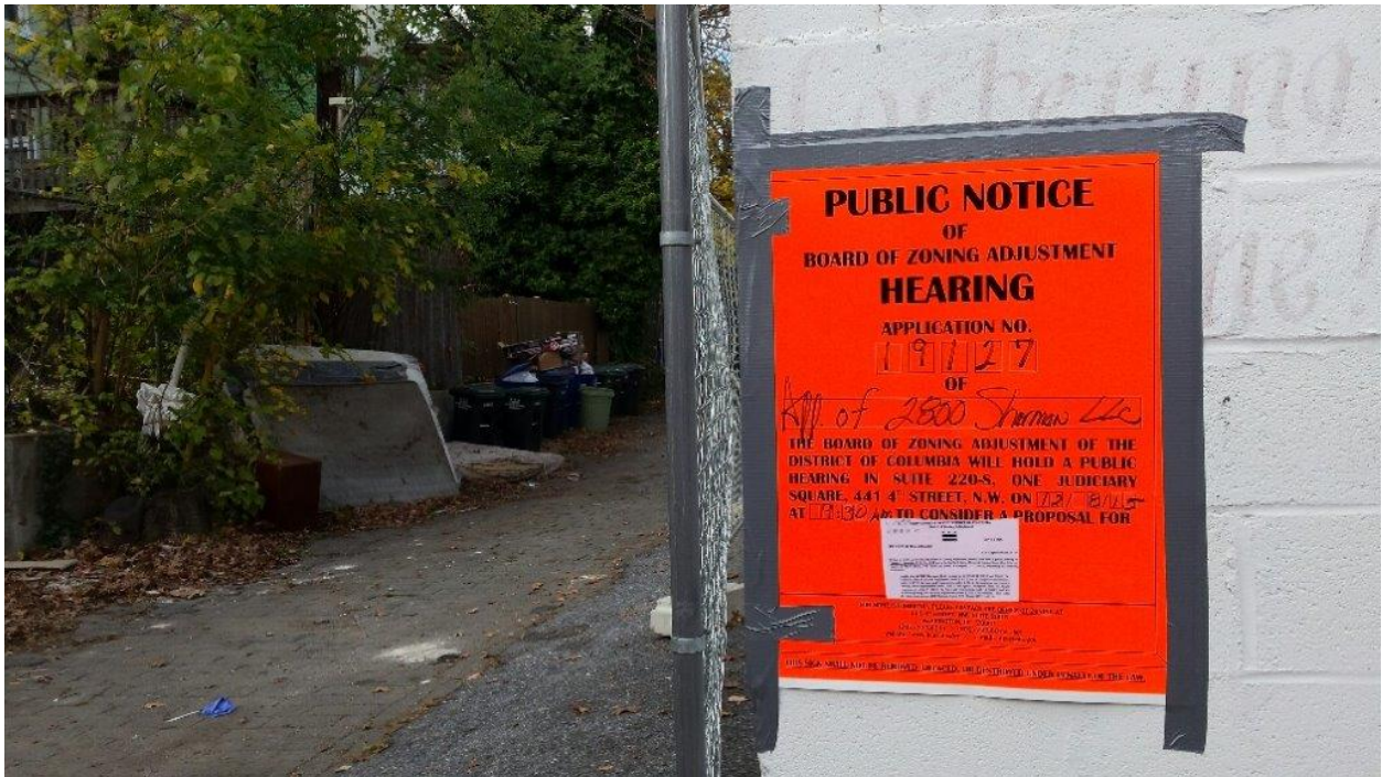
3. BZA 19127 Alley Posted 11-17-15