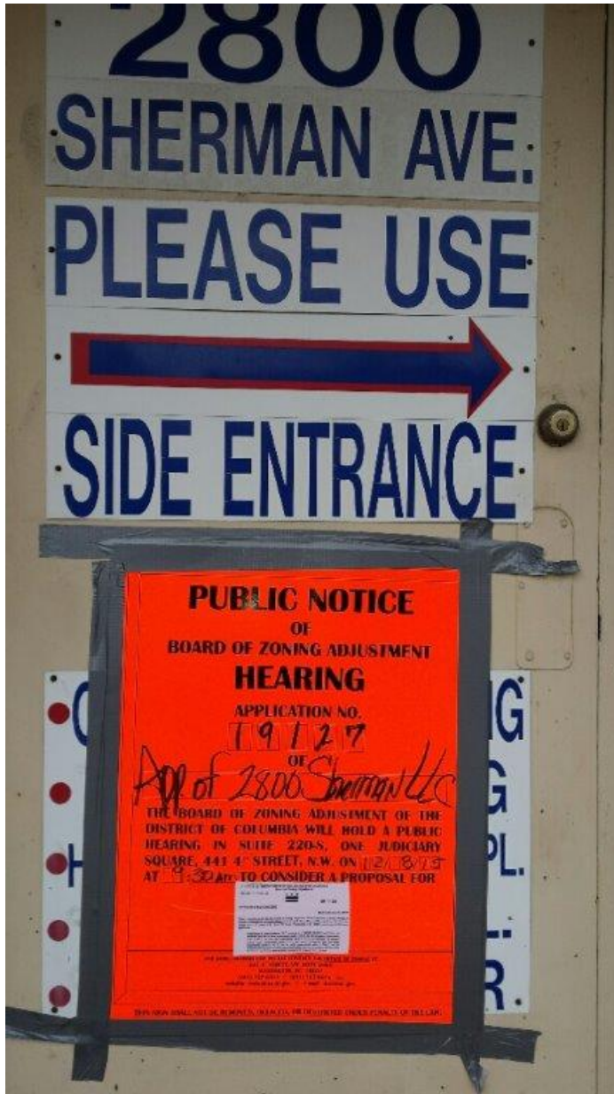
1. BZA 19127 2800 Sherman Ave NW Posted 11-17-15